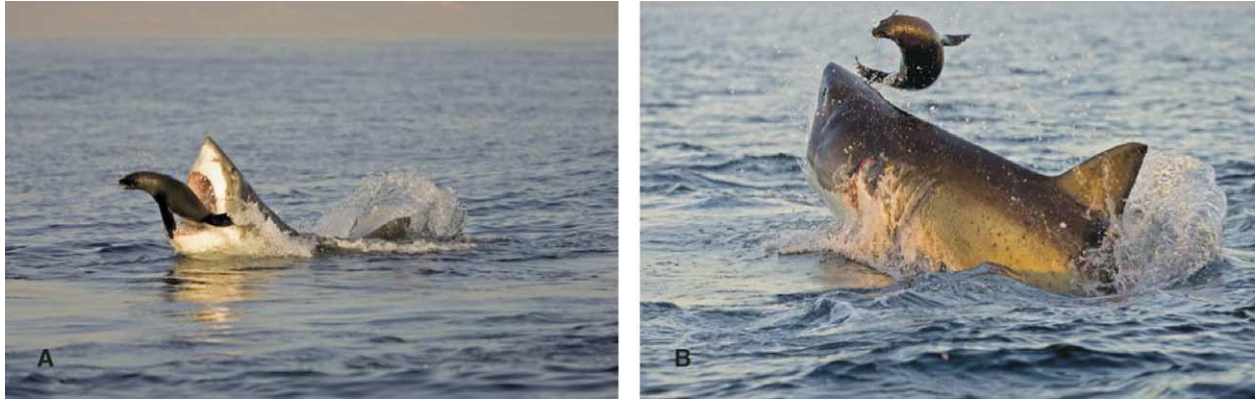
Figure 2. If a seal is not killed or disabled in the initial strike by an attacking shark, the seal has tactical advantages in terms of reduced turning radius. In both (A) and (B), a highly manoeuvrable seal evades an attacking shark during its secondary pursuit.

predicts a white shark should launch an attack below a minimum depth of 7 m in order to remain undetected while stalking seals from below, with enough vertical distance to build up momentum required for launching a vertical strike at the surface. At Seal Island, sharks patrol the waters at average depths of 12–14 m; however, attacks occur over a depth range of ~7–31 m, with significantly higher frequency of attacks occurring over depths of 26–30 m.